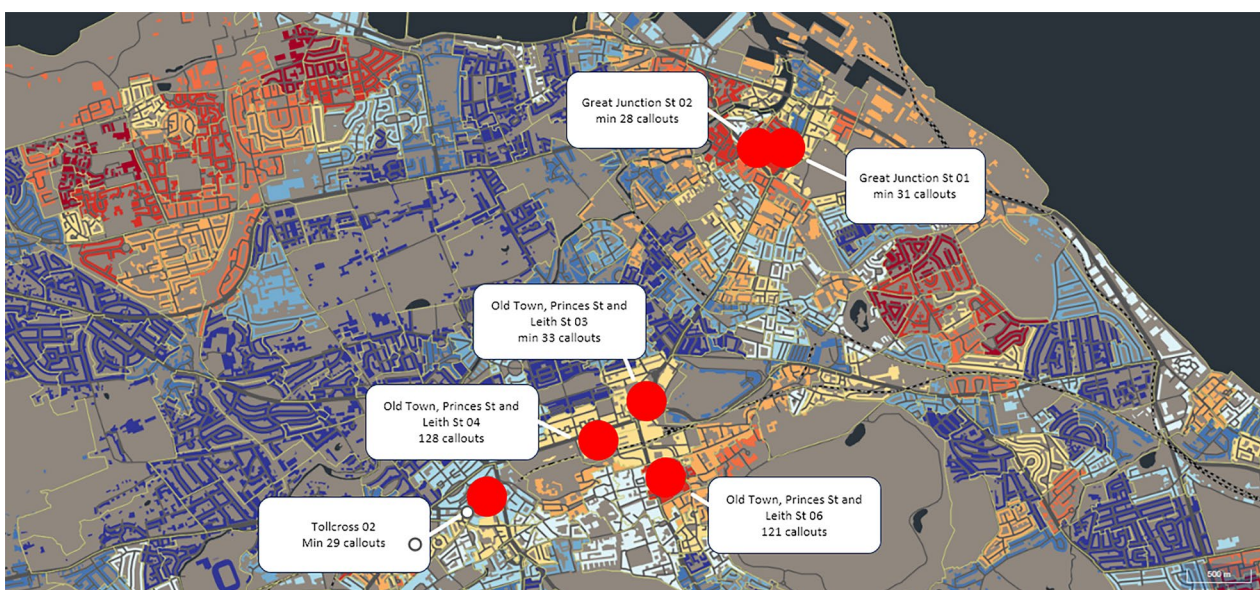
Fig. 2 Edinburgh datazones with minimum of 25+ NFD callouts 2017–21