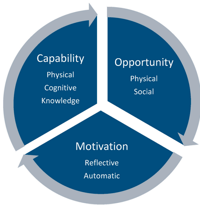
Fig. 1. COM-B model.

the theme and whether this is regarded as a barrier of facilitator (see Tables 2–8).