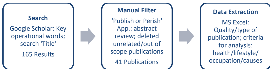
Fig. 1. Systematic literature review

This data was then classified into topics for discussion and narratives developed to elucidate existing knowledge, in relation to the research questions. These 41 publications constitute the main source of literature used for data extraction and are summarized in the Fig. 1.