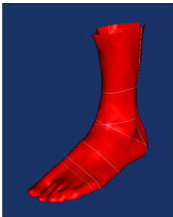
Figure 1 Scan of the foot (taken using Easy-Foot-Scan from OrthoBaltic (Kaunas, Lithuania)).

Initial searches for this review were carried out in March/April 2010 in the PubMed, and ScienceDirect databases.