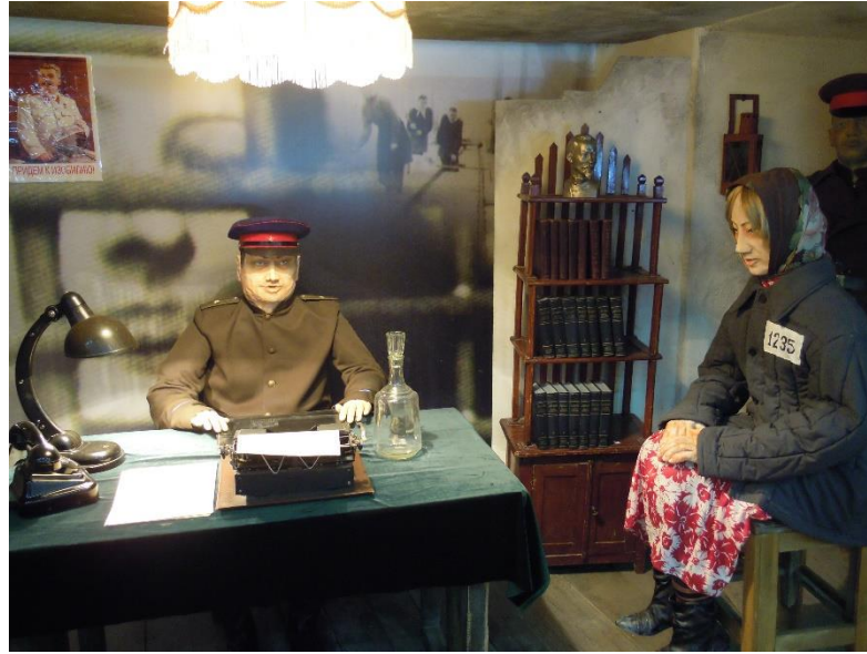
Figure 3: Diorama depicting a prisoner being interrogated, Alzhir museum (Source: Author).

In the basement of Karlag museum, a range of rooms using mannequins in dioramas portray various elements of Gulag'. Radically contrasting with the halls and exhibitions dispatched on the first floor, the basement level of the Karlag museum is attempting to offer visitors a simulation. According to Kuznetsova (2016, as cited in Trochev, 2018), the deputy governor of the town deliberately insisted on installations in Karlag that were frightening, which was believed to be creating more attraction for tourists. Yet cells and interrogation and execution rooms were actually located in another (now demolished) building. As one of Karlag historians recorded: