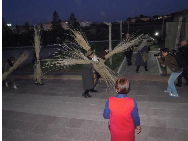
Figure 4: Staged re-enactment of Gulag life in Alzhir museum (Source: Author).