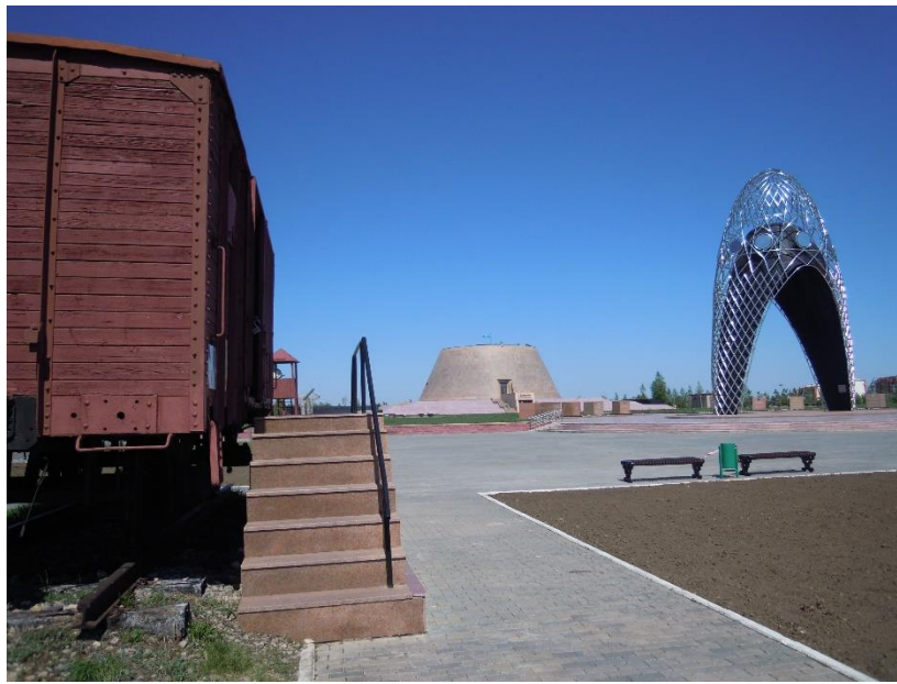
Figure 2: The Alzhir museum (truncated cone in the back), the Arch of Sorrow and the train carriage from the Stalin era.

Made in a helmet shape symbolising male strength and female innocence and purity, the colours of the Arch evoke: accord and harmony between people, religions, and cultures of different ethnic groups as well as the ‘permanence of good and bad in life’ as opined by the architect of the museum. Designed in the shape of a truncated cone, the museum building has purposively no windows ‘as a means to make something secret being known’ (Alzhir Museum, 2018a).