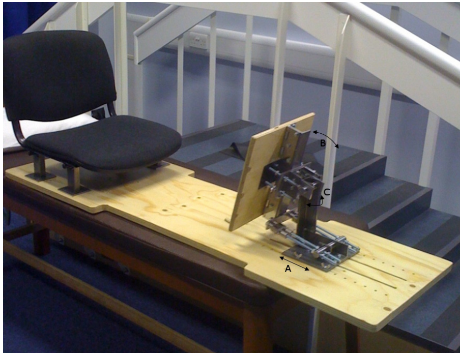
Figure 2 Loading rig. A: loading plate can be moved linearly to accommodate different leg lengths; B: plate can be tilted to give plantar/dorsi flexion of the foot; C: plate can be tilted to invert/evert the foot.

216 (interpolated); phase encoding, anterior to posterior; number of averages, 2.