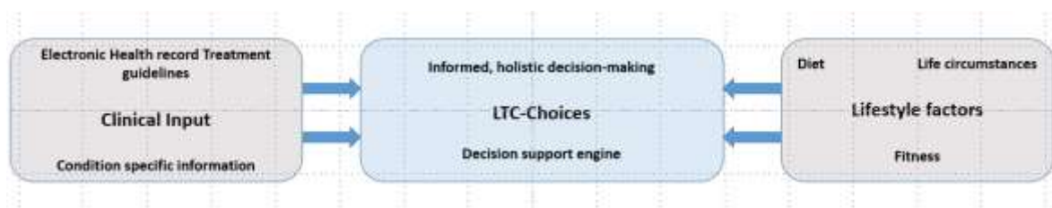
Figure 1. LTC-Choices Architecture

By way of example, in this figure we suggest Clinical Input might be derived from a patient’s electronic health record (such as myHealth record, for example, as adopted in Australia, and other countries (Adler-Milstein et al, 2014)), or perhaps standard quality controlled clinical guidelines (such as those provide by NICE in the UK (NICE guidelines (2018))). Lifestyle factors could include aspects such as information about the individual’s fitness, current diet, and life circumstances (which could include an array of information relating to aspects such as whether the individual lives alone, social networks, support networks, dependents).