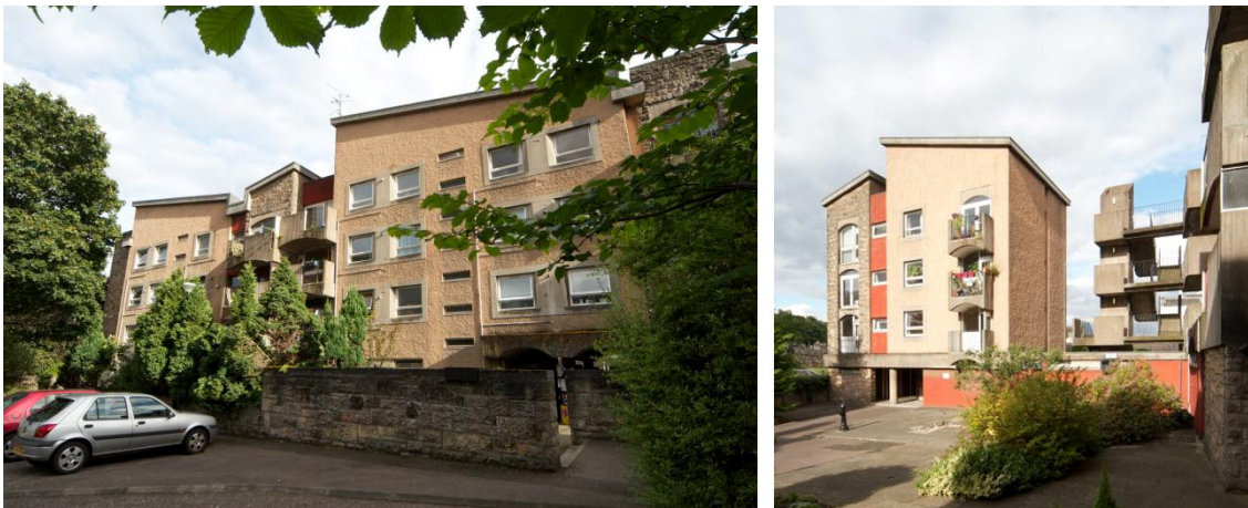
Figure 4. Photographs of rear elevations: The left photo shows the north-facing façade of block 1, the right photo the west-facing façade of block 3 with the external stair to block 2 on the right.