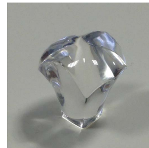
Figure 1: An RADTIRC sample.

The RADTIRC is a variation of dielectric totally internally reflecting concentrator (DTIRC) and the process to design the RADTIRC has been discussed in detail in [6]. In contrast to the rotationally symmetric version, the RADTIRC is mirror symmetrical in two axes parallel to the base of the concentrator. Hence the entrance aperture is not a semi-hemispherical dome shape as in the DTIRC, but a faceted one, with different fields-of-view on different planes. The concentrator has a half-acceptance angle along the x-axis of \pm 30^\circ representing the change of the solar altitude angle during the year. An example of a variation of the RADTIRC is presented in Figure 1. The