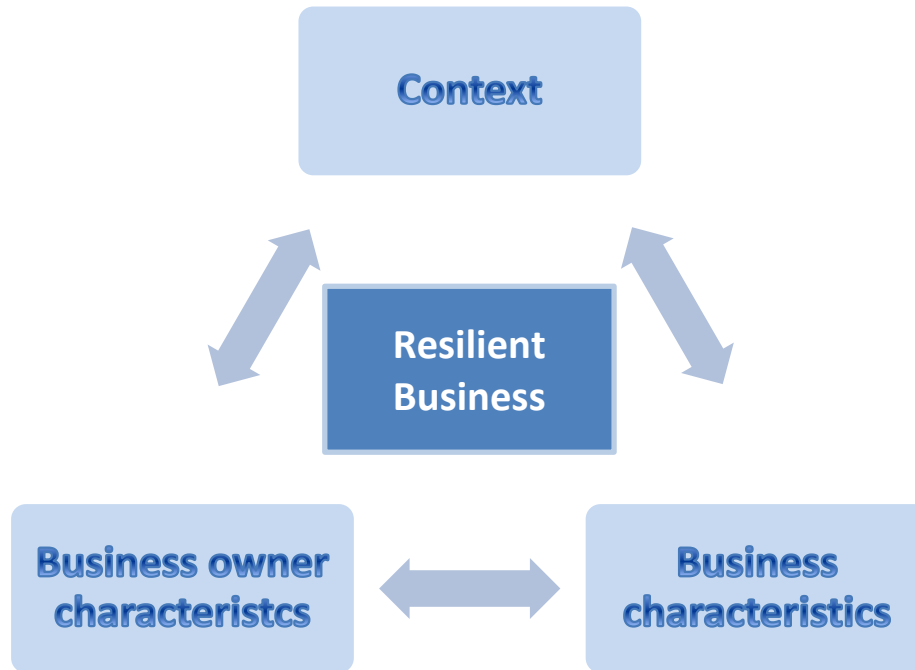
Figure 2. Elements of Resilient Business.

their business profile to and fit well with the local surroundings. Hence, it is a combination of the ‘characteristic of business owners’ and the ‘characteristic of their businesses’ that can assist (or alternatively hinder) the development of resilient rural businesses in a specific context.